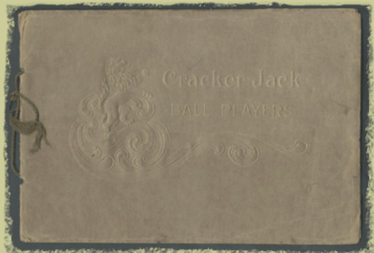
1915 Cracker Jack Album